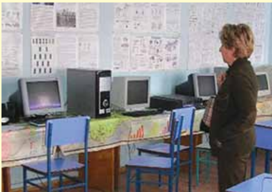
Isahakyan Village School Computers