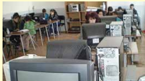
Khor Virab Village School Computers