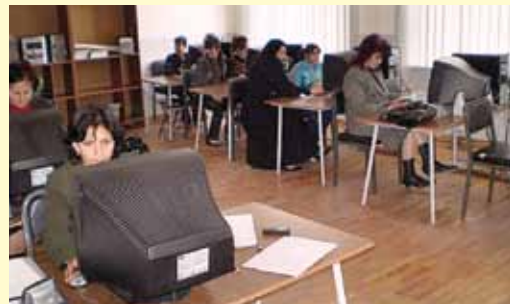
Verin Artashat Village School Computers